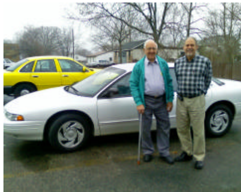
Wesley Community Services vehicle donation program is a Win Win for all.