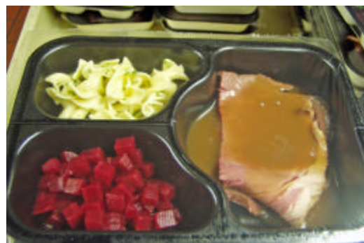
Senior Choice™ home delivered Meals-On-Wheels direct from our state-of-the-art kitchen. Featured entrée is one of many favorites - roast beef with gravy, fresh beets, and buttered noodles.